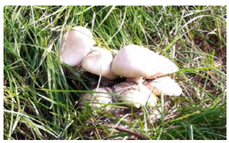
Fig. 2. Cluster of young M. titans mushrooms in Athens, Ga., in October 2012.