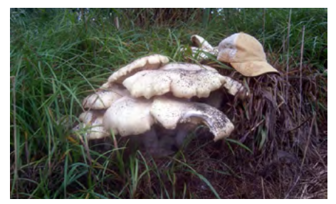
Fig. 1. Cluster of mature M. titans mushrooms in Athens, Ga., in October 2012. An adult-size baseball cap was placed in the background for scale.