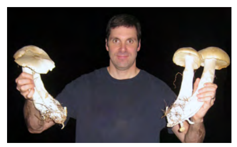
Fig. 3. Mushrooms from clusters of M. titans collected in Athens, Ga., in October 2012.